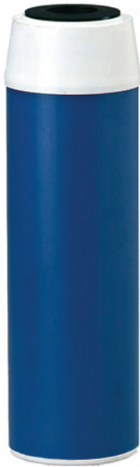
CGT-10S Replacement Cartridge: DEV9108-13